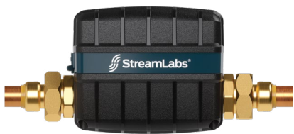
StreamLabs Control: Auto-Shut-Off

Monitor water usage and receive leak alerts for multiple properties, all through one app on your mobile device