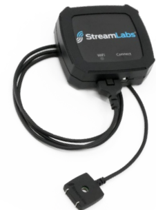
StreamLabs Scout: Sensor