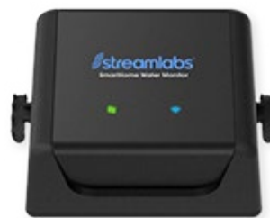
StreamLabs Monitor: Flow Meter