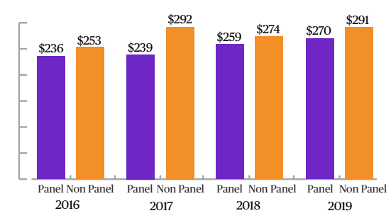
chart with panel v. non-panel for average partner rates

According to a 2019 Chubb study of US MPL claims data from 2009-2015, the average total loss for an MPL claim reported to Chubb was $227,000, with an average payment amount of $164,000 for loss paid by Chubb in excess of the Insured's self-insured retention.